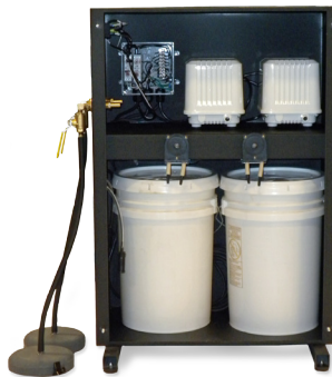
Shown with side panel removed